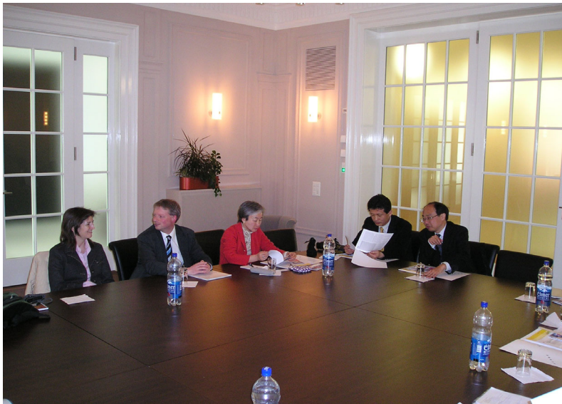
During the meeting and presentation of AntOptima SA at the Federal Department of Finance in Berne...